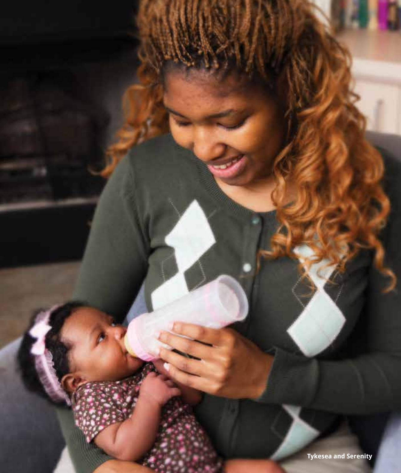
Tykesea and Serenity