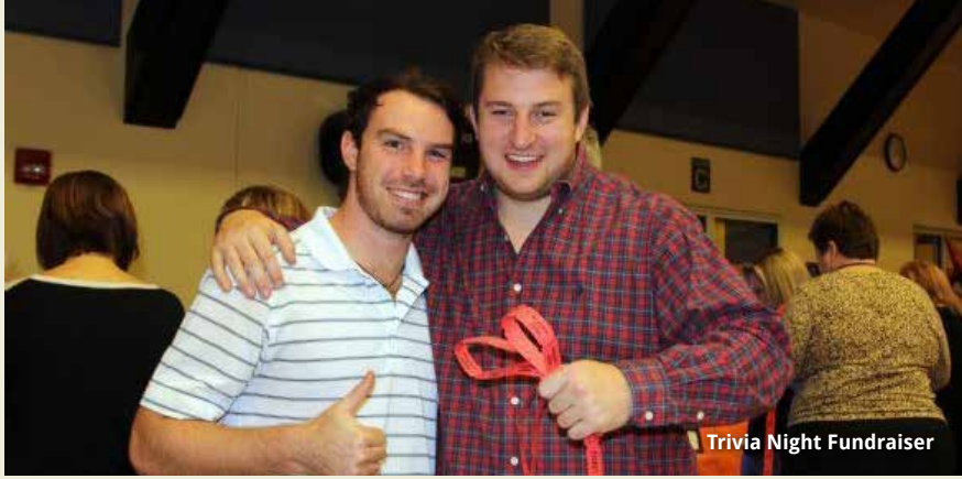
Trivia Night Fundraiser