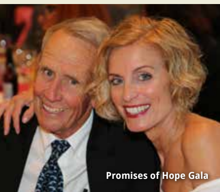
Promises of Hope Gala