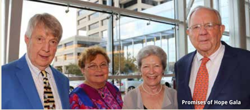
Promises of Hope Gala