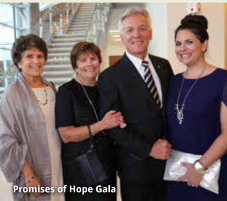
Promises of Hope Gala