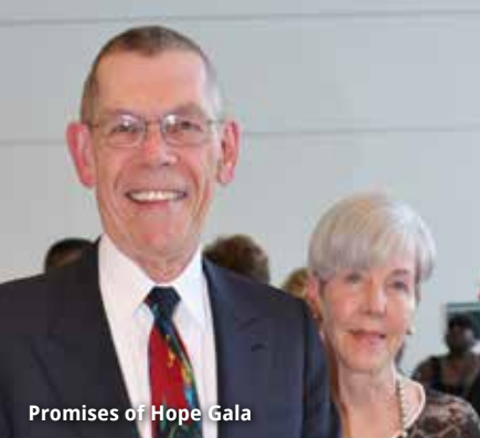
Promises of Hope Gala