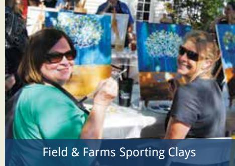
Field & Farms Sporting Clays