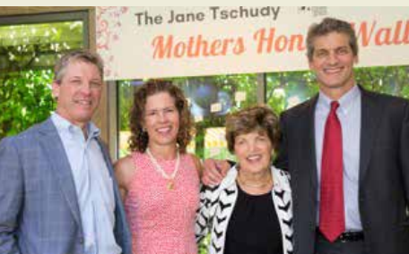
Celebrating Moms Luncheon

City Of St. Louis Homeless Services Walz Family Charitable Fund