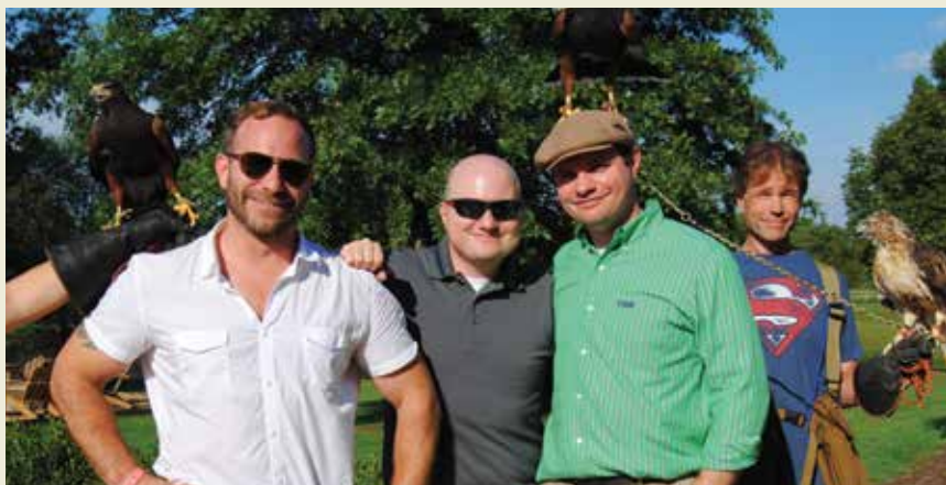
Field & Farms Sporting Clays